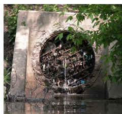
Left: Aerial view of Ecorse Creek flowing into the Detroit River. Middle: Photo taken at a summer cleanup on Ecorse Creek. Right: An Ecorse Creek outfall filled with debris.