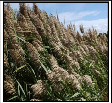
4. Common Reed