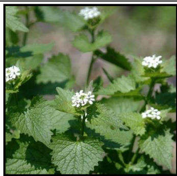
13. Garlic Mustard