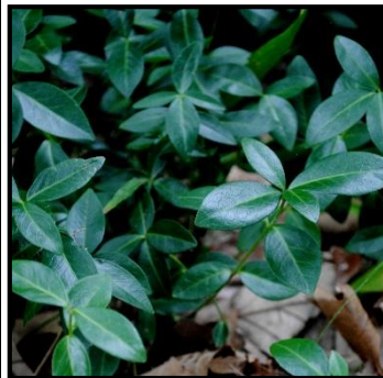
7. Common Periwinkle