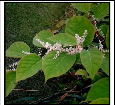
16. Japanese Knotweed

How many did you find? _____ Can you spot these invaders in your neighborhood?