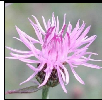
15. Spotted Knapweed