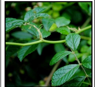
8. Multiflora Rose