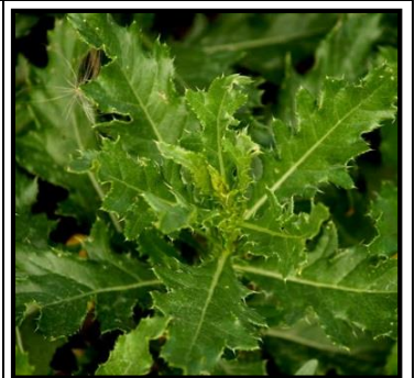
12. Canada Thistle