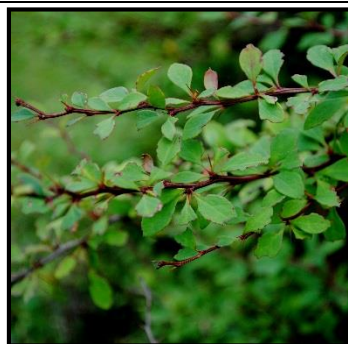
14. Japanese Barberry