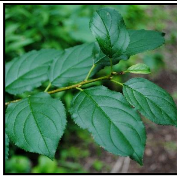
2. Common Buckthorn