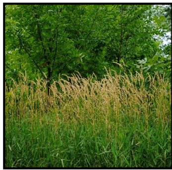
5. Reed Canary Grass