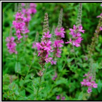
3. Purple Loosestrife