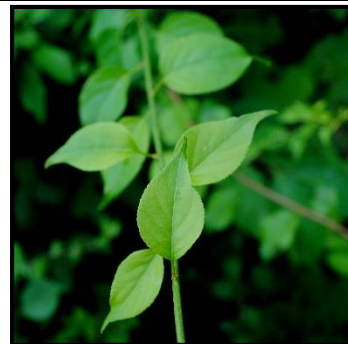
10. Oriental Bittersweet