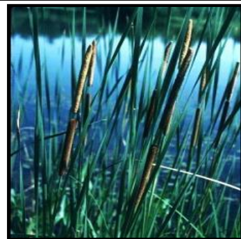
9. Narrow-leaved Cattail